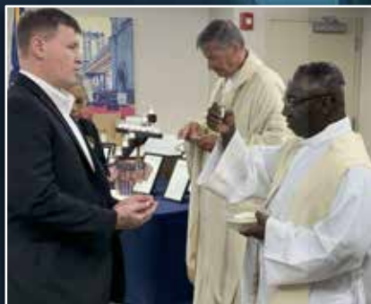
The Memorial Mass provides a solemn conclusion to the annual convention.