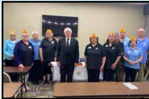
Members of the Auxiliary welcome their new member!