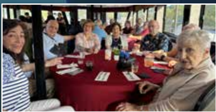
After a long day of convention meetings, members set sail on the Skyline Princess around Manhattan.