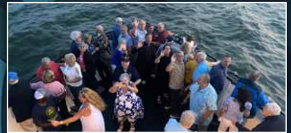
It's party time on the bow as the boat approaches the Statue of Liberty at dusk.