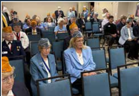
Veterans and Auxiliary members assemble for a joint session for Mass and presentation of individual and post National Awards.