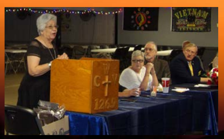
Auxiliary and Veterans reconvene for a joint afternoon discussion.