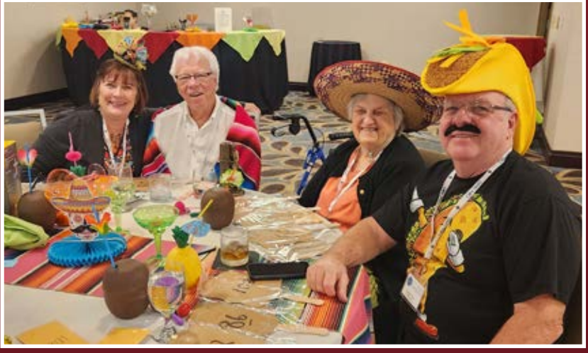
Members of Southeast Suburban Post 1812, located in Garfield Heights, Ohio, don their best "South of the Border, Down Mexico Way" regalia to add to the festive evening!