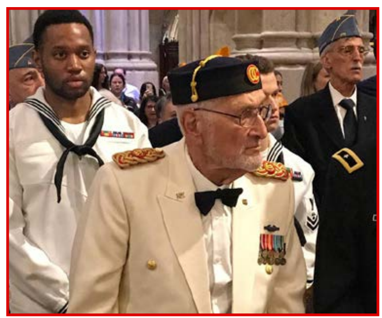
Veterans old and new, including invited Fleet Week sailors, filled out CWV reserved pews.