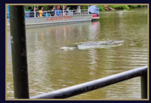
Alligator greets visitors on the swamp tour!