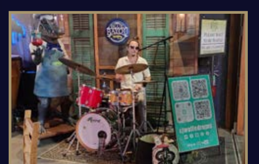
Members experienced the Cajun culture!