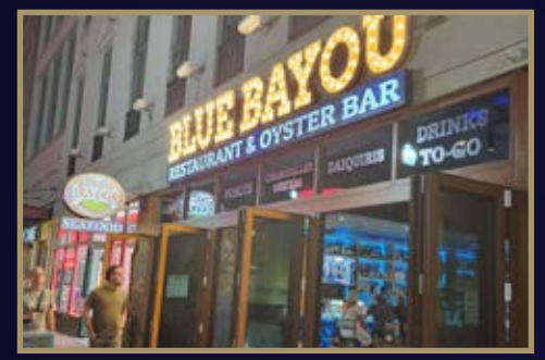
The city famous for food and music!