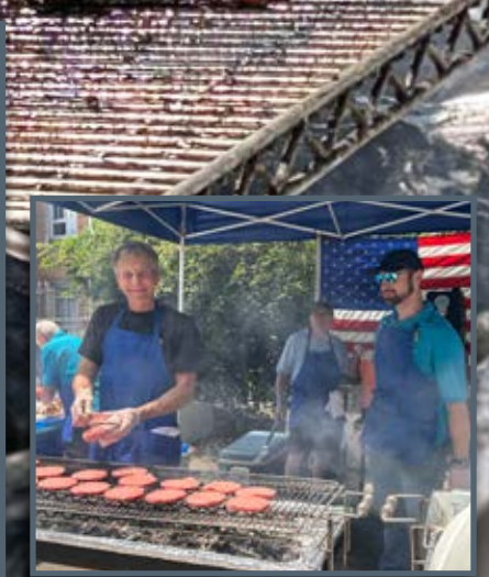
Additional Volunteers manned the grill!