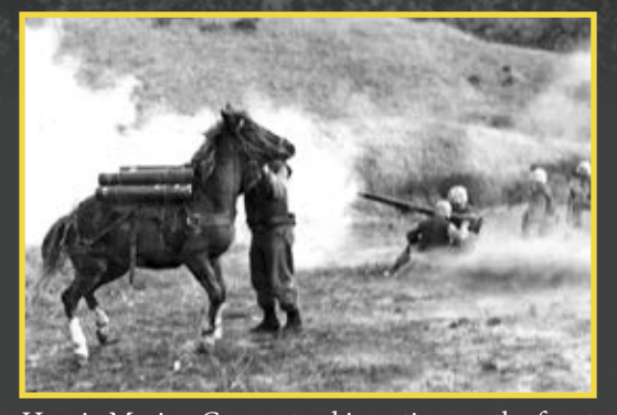
lines of the Korean War, near the 38th Parallel.

The battle for Outpost Vegas was waged between forces of the United Heroic Marine Corps steed in action on the front Nations Command and China from 26-30 March 1953, four months before the end of the Korean War. Vegas was one of three outposts called