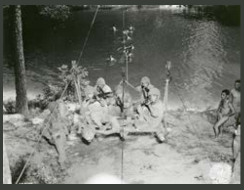
Men from the 442nd practicing training maneuvers in Camp Shelby, Mississippi.

Today, the 442nd is remembered as the most decorated unit for its size and length of service in the history of the US military. The unit, totaling about 18,000 men, earned over 4,000 Purple Hearts, 4,000 Bronze Stars, 560 Silver Star Medals, 21 Medals of Honor and 7 Presidential Unit Citations.