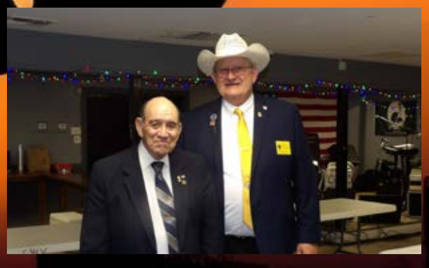
Wisdom is exchanged between Commanders old and new!