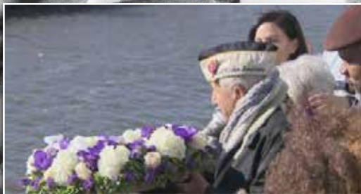
At USS Intrepid, New York