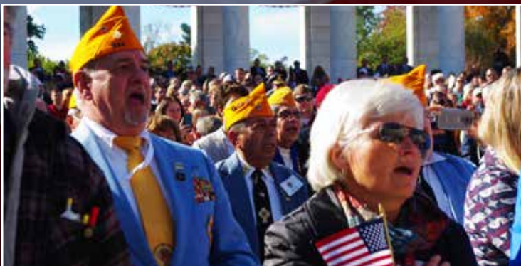
Some 300 members attended to represent this year's host organization—the Catholic War Veterans and Auxiliary. It will be 19 years until it is our turn to do it again!