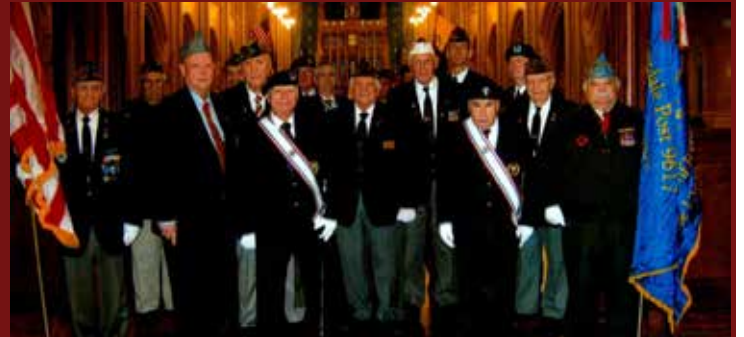
Veterans Mass at St. Mary's Church, attended by Kulka Bros. Post 1957, American Legion Post 3, VFW Post 9617, Knights of Columbus Color Corps.