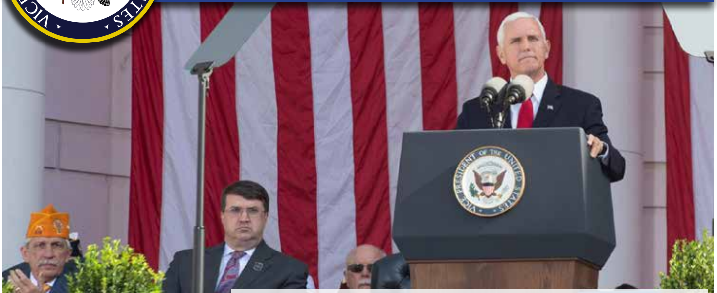
Vice President Pence delivers the keynote address. President Trump was the first President to join the National Veterans Day Parade in New York.