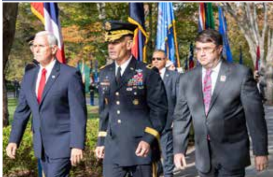
Vice President Pence is joined by Secretary of Veterans Affairs Robert Wilkie.