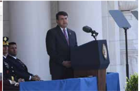
VA Secretary Wilkie presents remarks.