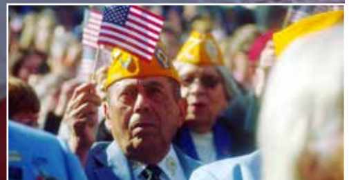
CWV member shows patriotic spirit.