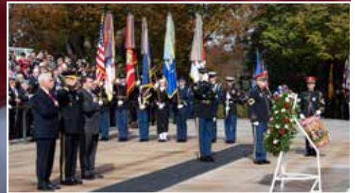
Vice President Pence places the wreath.