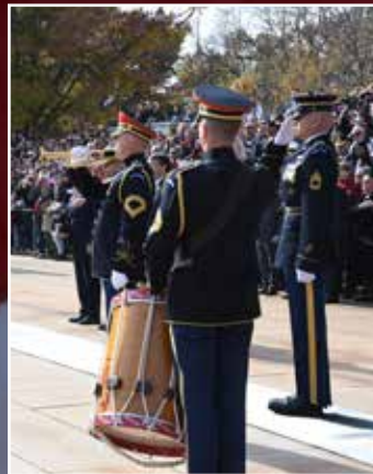
The crowd is stilled as the bugler plays Taps.