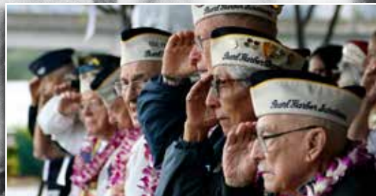
At Naval Base, Pearl Harbor