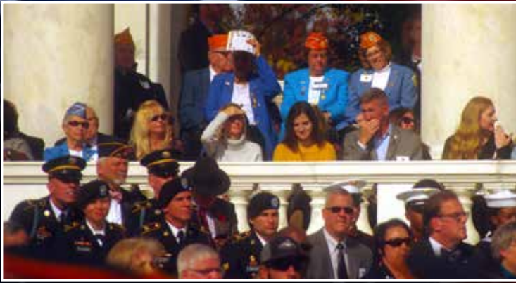
Led by its President, the CWV Auxiliary was well represented.