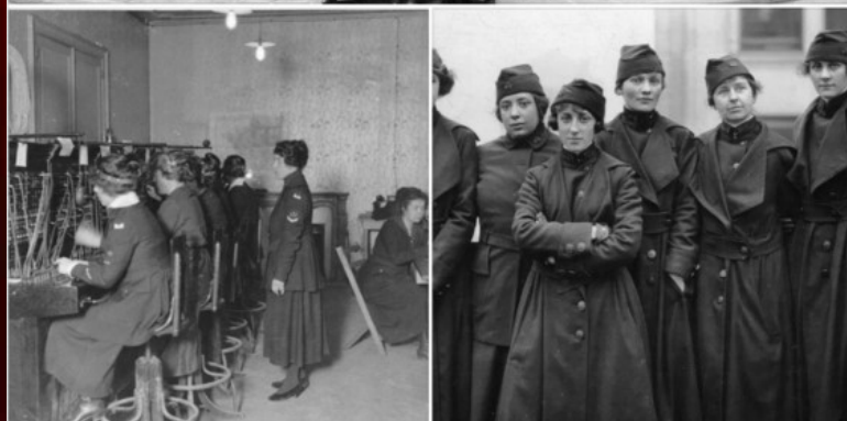
Congress is considering the Congressional Gold Medal Act of 2019, a bipartisan bill that would serve to honor the heroism and patriotism of more than 200 women who served our country as battlefield telephone operators in WWI.