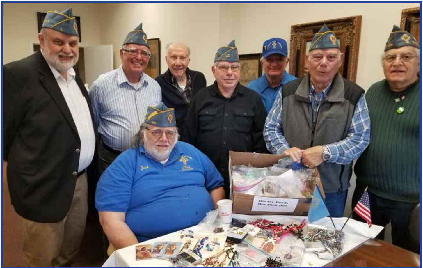
SUPPORTING THE 1st VICE COMMANDER'S PROGRAM ~ The Kings County Chapter (Brooklyn, New York) held a rosary collection to support this program. Over 600 rosaries were collected.