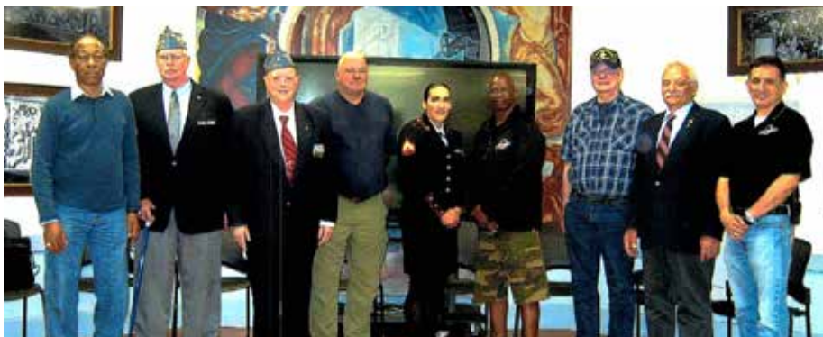
Post members, active duty military, Jewish War Veterans and teacher veterans gave presentations to students.