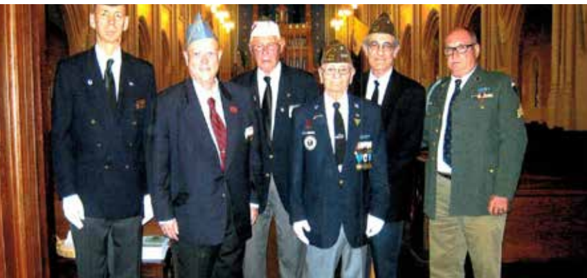
Officers of the Catholic War Veterans Kulka Brothers Post #1957 join members of the Veterans of Foreign Wars at a Veterans Memorial Mass in St. Mary's Church in Stamford, Connecticut.