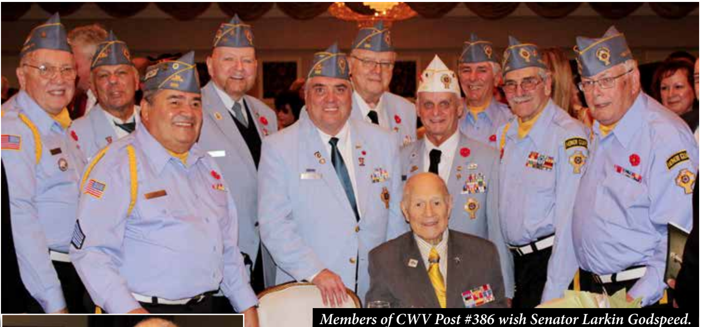
Members of CWV Post #386 wish Senator Larkin Godspeed.