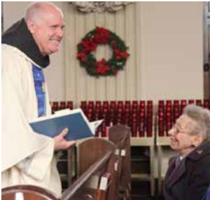
Father reads a special prayer and blessing.