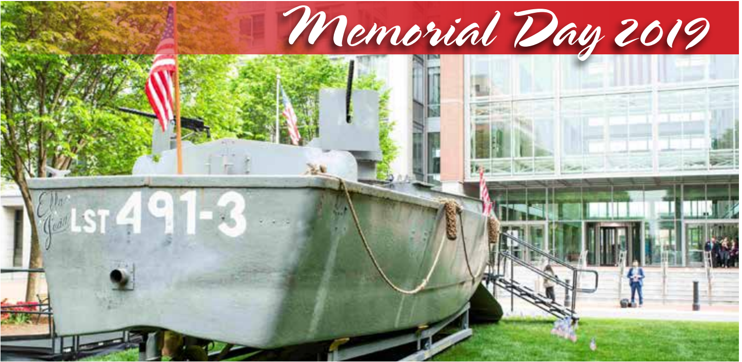
WORLD WAR II VETERAN! One of only 20 existing D-Day landing craft is on display at the National Inventors Hall of Fame in Arlington, Virginia, as part of an exhibit on wartime innovations.