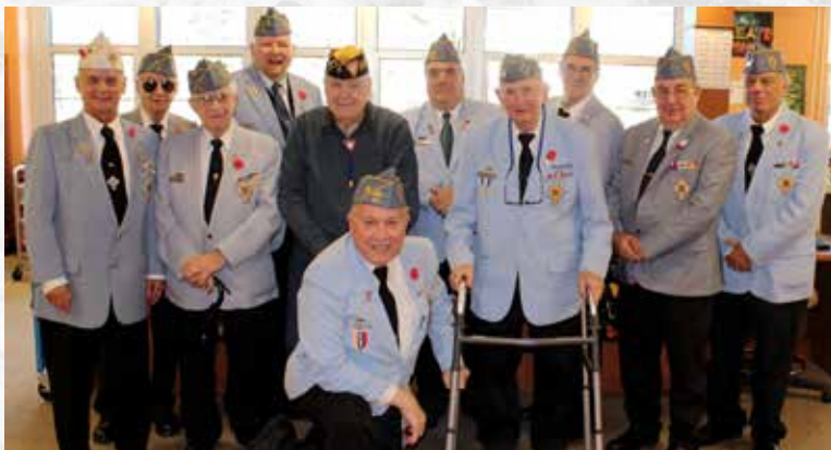
Members of CWV Post #386, Newburgh -New Windsor, NY pose for a photo.