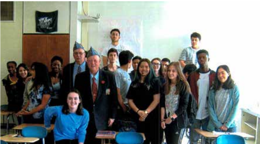
Members of Kulka Brothers post also visited Stamford High School's Memorial Day assembly and addressed the students about the true meaning of the holiday and the debt they owe veterans.