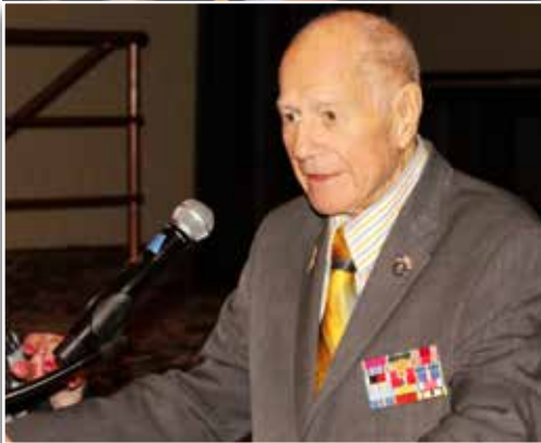
Senator Larkin bids farewell.