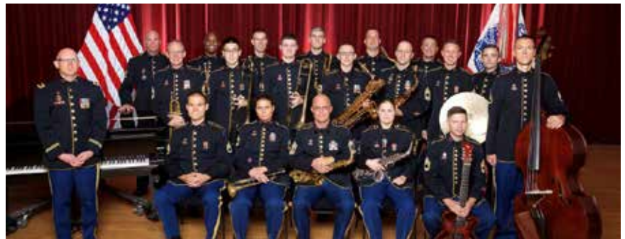
Other participants in centennial activities include the U.S. Army Band, “Pershing’s Own.” The Band was founded in 1922 by General of the Armies John J. “Black Jack” Pershing to emulate European military bands he heard during WWI.

For information and inquiries, contact: The Exchange Club of Rome, Georgia P.O. Box 1184 Rome, Georgia 30162-1184 (706) 766-8451 kingglfnt@yahoo.com http://tomb.romeexchangeclub.com/