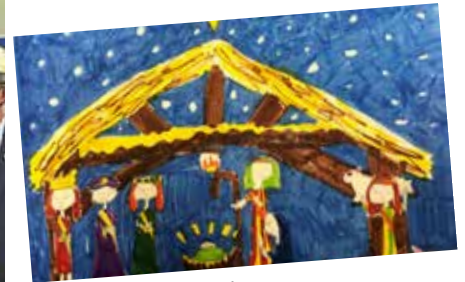
Camille's work of art!