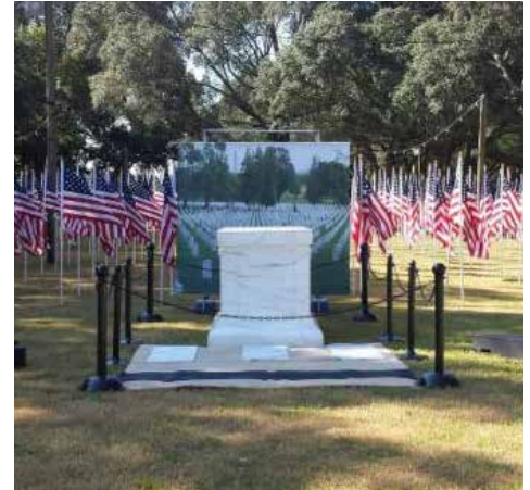
Replica of the Monument on full display!

The Exchange Club of Rome, Georgia has initiated a project called “A Call To Honor: The Tomb of the Unknown Soldier Replica.” It is a half-scale replica of the actual tomb, and they participate in events across the country to educate visitors on the Tomb and its Sentinels. Many communities are reaching out to have them come and set up. We offer this to our Posts as a suggested Americanism project.