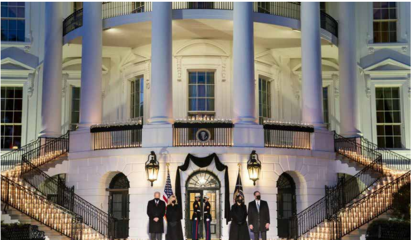
On the evening of 22 February 2021, President Biden, Vice President Harris and their Spouses led the nation in a moment of silence amidst 500 candles at the White House, marking the sad toll of 500,000 deaths in the nation due to the Covid-19 pandemic.

NON-PROFIT ORG U.S. POSTAGE PAID PITTSBURGH, PA PERMIT NO. 4123