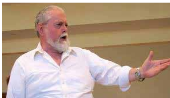
Belting out an aria in a professional production.

He also assisted at St. Malachy's Church, the Actors' Chapel in New York City. He has enjoyed singing and performing with such companies as Jazz at Noon, the Amore Opera Company, the Village Light Opera, the Bill Hill Troupe and Light Opera of Manhattan. He has sung a number of solo concerts, has over 1,000 appearances to his credit, and has published four CD's.