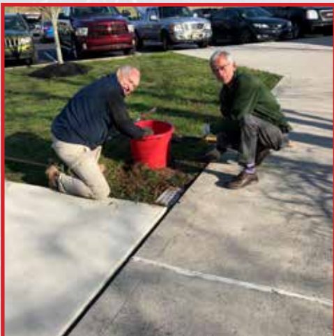
It all starts with a good foundation!

Fundraising events included an Oktoberfest Party, BBQ Dinner, Hearts for Heroes and Poppy donations. Once the money was raised, the Post purchased the glider and assisted in installation.