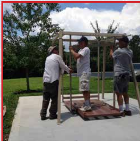
Flange B goes into Tab A?