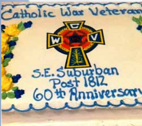
The Charter Commander returned for the 60th Anniversary Celebration as Post Commander at age 92!