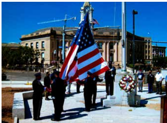
Members of the Post assembled with City First Responders to conduct Flag Day ceremonies in Stamford on June 14th. In view of COVID-19, face masks were worn by all while also social distancing during the event. The Police Department Honor Guard conducted the Flag raising.